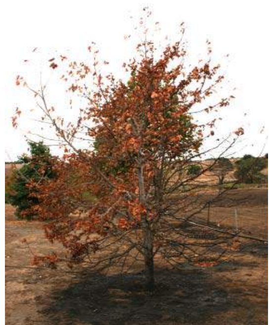
Burning mulch damaged this tree. Its mate escaped more or less unscathed.

Water and fire are inimicable so it should perhaps not surprise that being waterwise and firewise should sometimes conflict. For example, mulching is a very useful and sensible water conservation technique but some of the most readily available materials - woodchips and shredded or composted bark - become a problem if ignited in a fire as they can become extremely difficult to extinguish, requiring recurrent attention to do so. Mulch can cause the loss of plants that would otherwise survive a passing fire. Non-flammable materials such as pebbles or gravel are to be preferred where fire presents a threat even if they are less practical or desirable. (Plastic underneath mulching materials can also create a hazard)